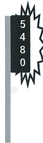
Installed on your post.